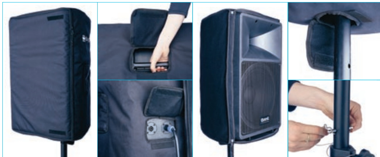
Products pictured: Carry Bag - QB500 / Pole Mount - QSSAL