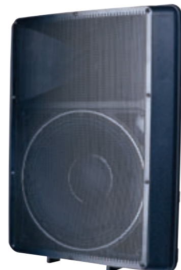
Optional protective grill

You don't have to blow your budget either because Quest Engineering has worked hard to bring you the QSA range at a great "bang for buck" price.